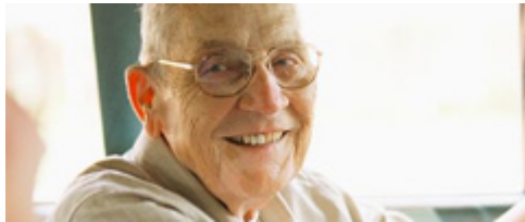
Fire Safety for Older Adults