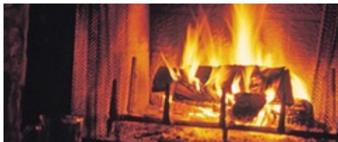
Home Heating and Winter Fire Safety