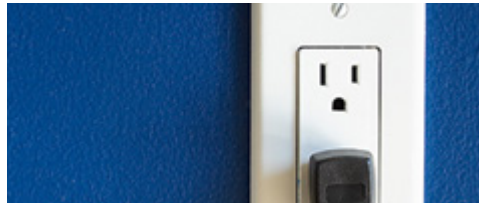
Electrical Fire Safety