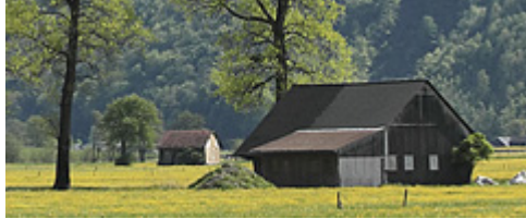
Rural Fire Safety