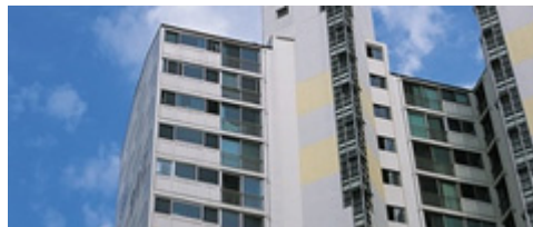
Highrise Fire Safety