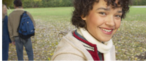
College Fire Safety