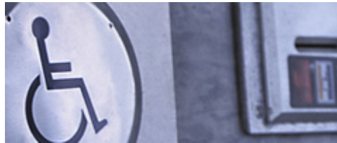
Fire Safety for People with Disabilities