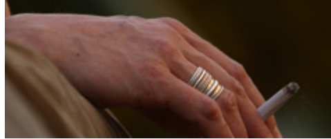
Smoking Fire Safety