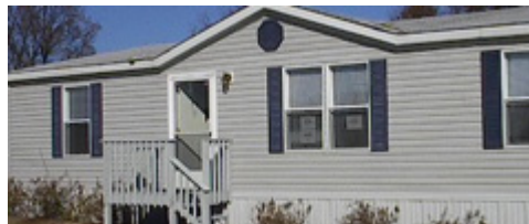
Manufactured Home Fire Safety