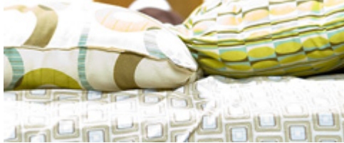
Bedroom Fire Safety