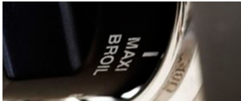
Cooking Fire Safety